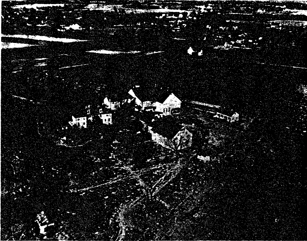
Aerial View of Silver Lake Farm