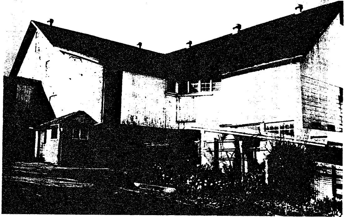
Zimmerman Barn Built in 1804